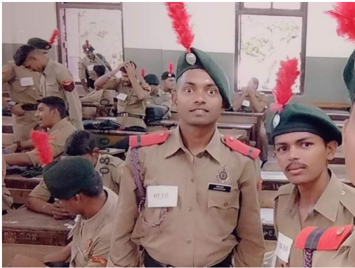
C Certificate exam was held on 8 th March 2020 at Kirti College, Dadar. 12 Cadets appeared for the same.