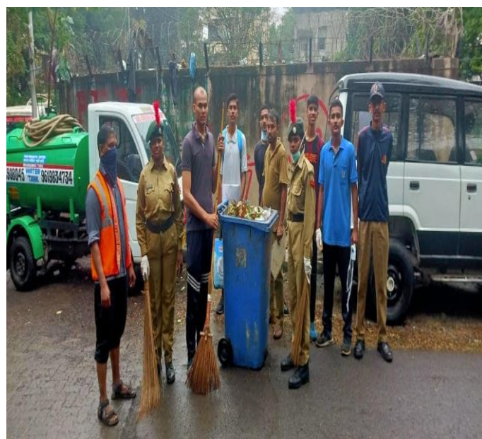
Swachata Abhiyan by the NCC unit of Rizvi College of A/S/C along with the BMC staff was conducted in the neighbourhood on 5th Dec,19. 18 Cadets participated in the same.